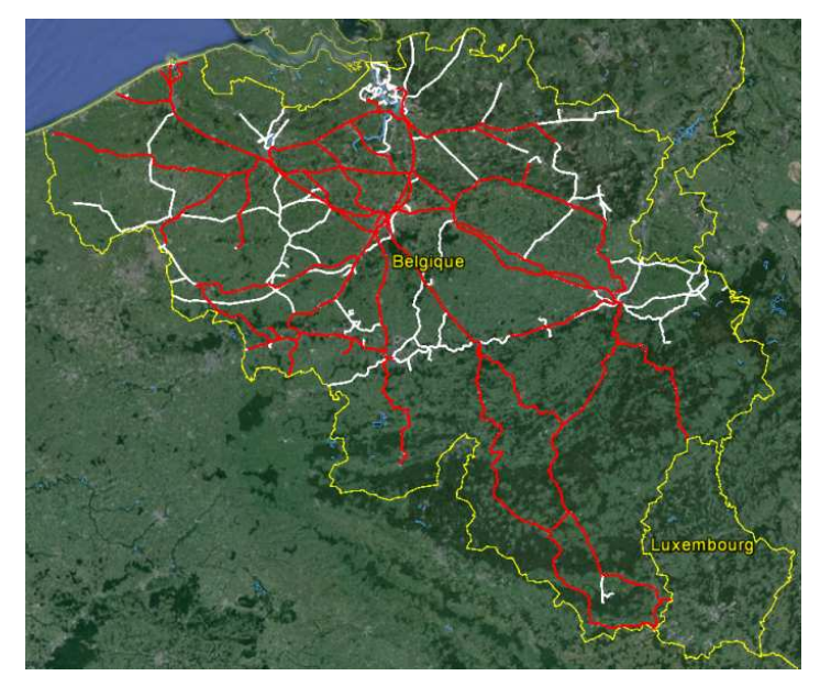
In red, the railways surveyed with imajbox in 2013

Infrabel is the Belgian public company that builds and maintains the 3.500 km railway lines (i.e. 7.300 km of tracks) of the national network. Already well supported by various GIS application, the Geomatics Division was looking for flexible mobile mapping system to collect new data and updates existing ones. To fulfill their requirements, the system had to limit external devices, be portable and reach absolute sub-metric accuracy.